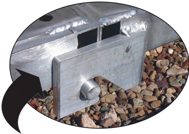
Unique safety latch secures both halves of the aluminum cart together, preventing the separation of the assembled cart. After use, removing the safety latch allows the two halves to be lifted upward and separated for easier removal and storage.