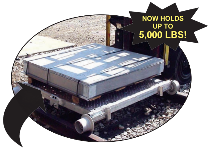
NEW! Nolan's ATS aluminum carts now hold up to 5,000 lbs! Testing was conducted transporting 5,000 lb loads.