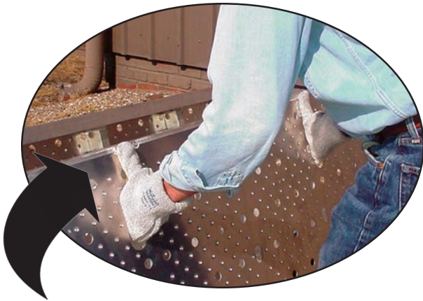
Ergonomic hand-holds in deck surface allow easier and safer handling during assembly and storage.