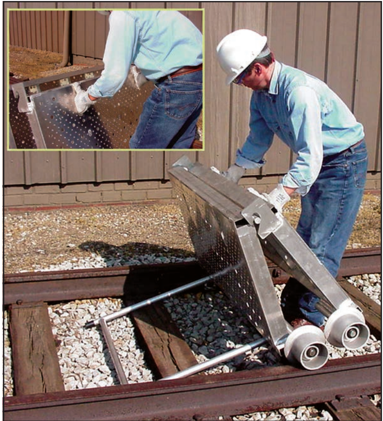
▲ Hand holds in the ATS-1B's deck make assembly easy.

▼ The ATS-1B cart shown after the two halves are connected and unfolded onto track assembled with handle in position.