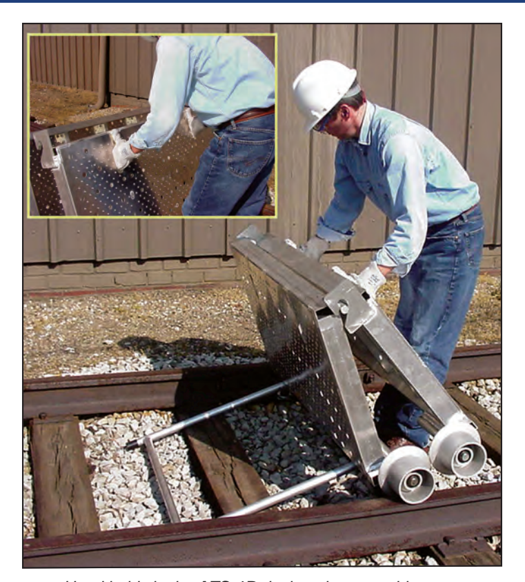
Hand holds in the ATS-1B deck make assembly easy.