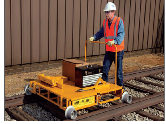
The taller handle enables heavier loads to be moved easier.

Join the two interlocking ends by positioning the two halves of the cart, with all the wheels on the rail, while keeping the center raised. Gradually lower the middle of the cart to create one solid unit.