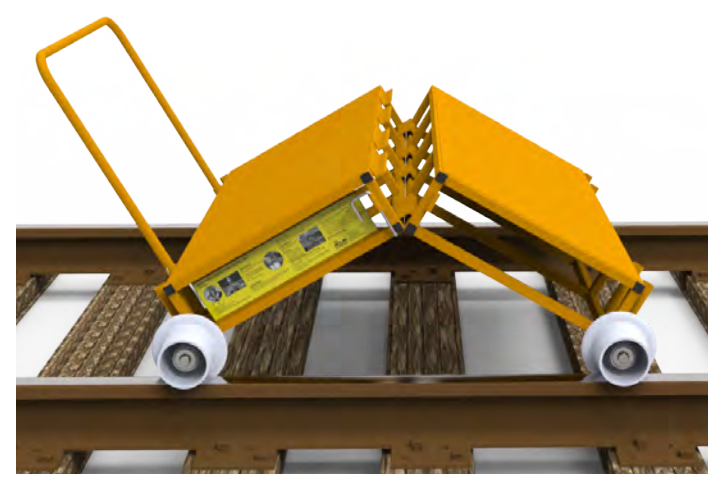
TS-4 interlocking halves