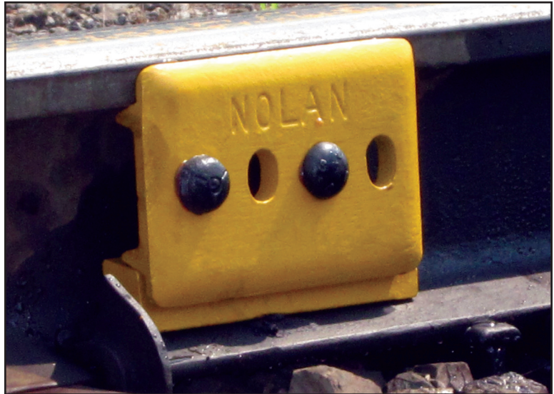
▲ SPP-6 installed on track with shim beneath

NOTE: Review the installation instructions that accompany each switch point protector.